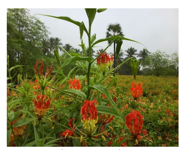
Fig 4:Gloriosa superba