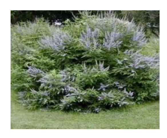
Fig 3: Vitex negundo