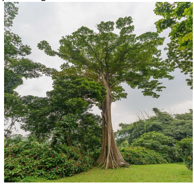
Fig 6: Terminalia bellerica

Large, deciduous tree,12-50 m tall with dark grey fissured bark.Leaves alternately arranged or fascicled at the end of branches , elliptic or obovate, leathery, entire,8-20 cm long and 7.5-15 cm wide.Flowers greenish yellow, small about 5-6 mm across, in long axillary and terminal spikes about 5-15 cm long, upper flowers of the spike male, lower ones bisexual; fruits obovoid,1.5-2.5 cm in diameter, 5 —ridged, grey-velvety; seeds indistinctly five angled.