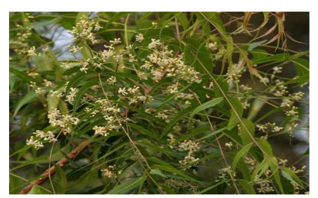
Fig 1: Azadirachta indica

Common name: Margosa (English), Neem (Hindi)