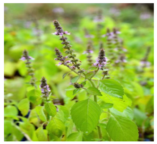
Fig 2: Ocimum sanctum

Tulsi is a medicinal and holy plant native to the Indian subcontinent. It is also referred to as Manjari or Krishna tulsi in Sanskrit. In the Hindu religious tradition, tulsi has symbolic significance and it is adored by a large number of Hindus in the morning and evening. It is an aromatic sub-shrub and also a cornerstone of Ayurveda, the traditional Indian herbal medicine. Each part of the Tulsi plant possesses medicinal properties and so every part of the Tulsi plant can be used in herbal remedies to treat a variety of conditions.